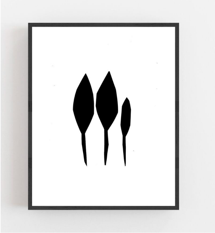
CUT PAPER PLANTS 3 & 4 Handpainted paper decorated with pastel texture and assembled by hand